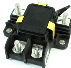
LITTELFUSE® Sealed HPDM 2 Pole MEGA Fuse Holder Item #46319