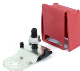
LITTELFUSE® SMZ Series ZCASE® Fuse Holder Item #45579