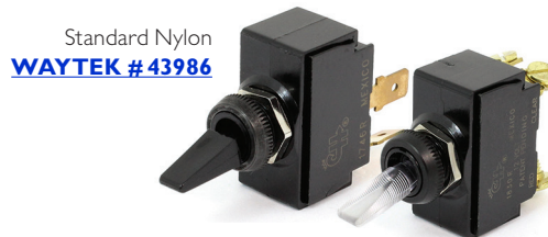
Standard Nylon WAYTEK # 43986