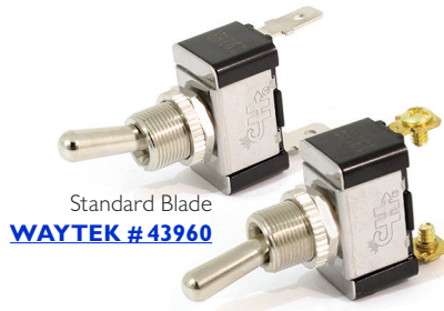
Standard Blade WAYTEK # 43960