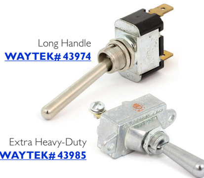
Long Handle WAYTEK# 43974