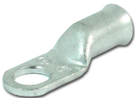
WAYTEK Tinned Copper Eyelet 5/16 Stud Item #36411