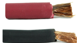
WAYTEK SGR Battery Cable Item #SGRI-2-100 Item #SGRI-0-100