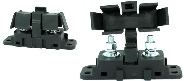
MIDI: WAYTEK # 45610