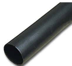
DSG - CANUSA Adhesive Lined Heat Shrink 4:1 Shrink Ratio Item #22226