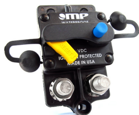
MECHANICAL PRODUCTS Series 17 Circuit Breaker Item #48917