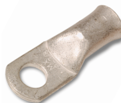
WAYTEK Tinned Eyelet 1/4" Stud Item #36400