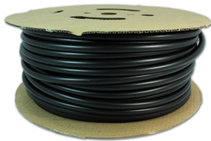
DSG CANUSA 3:1 Black Heat Shrink 1" Polyolefin Dual Wall Item #22216C